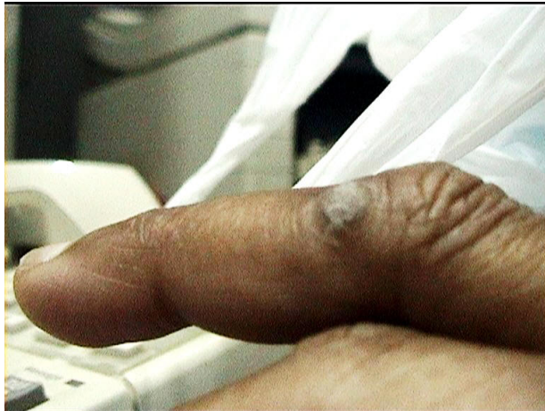
19th June 2005

On return to UK, I took another single dose of 2 pills of Thuja 6x, which dried, reduced and hardened the wart as it had done before. I kept rubbing the wart with banana skin and scratched off the dry skin with my nails. I took one pill of Thuja every fortnight to deter re-growth. By 26th Sept, the wart had nearly gone (see photo 13th Oct). The skin was still discoloured but there was no scarring. All traces of the wart have completely gone.